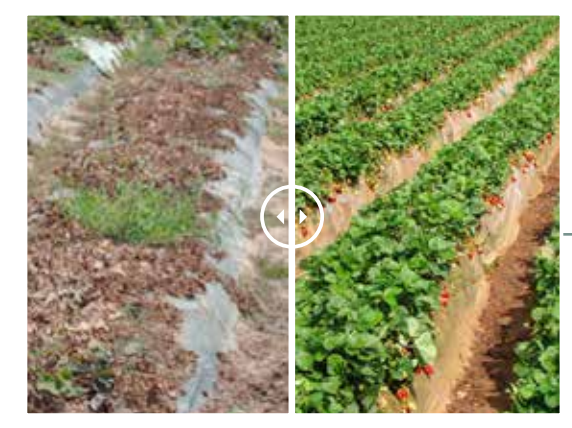
STRAWBERRY UNTREATED VS. TREATED

Did you know? According to the USDA "Every year, invasive insects and plant diseases cost the United States about $40 billion in lost crop and forest production. That figure does not include the significant cost to Federal, State, and local government agencies—and farmers and industry—to combat these threats once they have entered our country. Invasive pest and disease incursions can also result in foreign export markets closing to U.S. agricultural products that could be infested or infected. In calendar year 2021, U.S. agricultural exports were worth a record-breaking $177 billion."10 The TriCal Group cooperates with local, state and federal agencies to stop the movement of agricultural pests at the source—in the field.