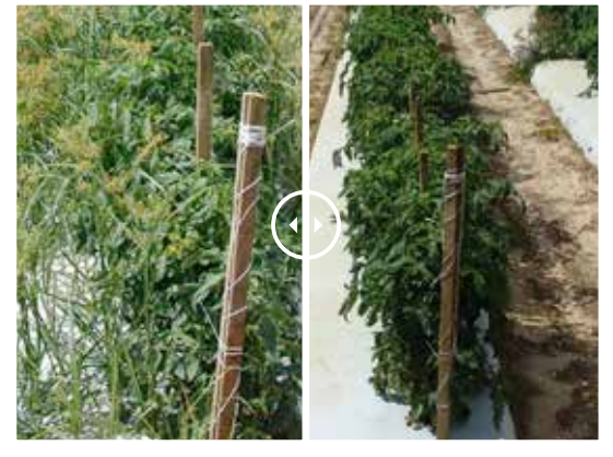
TOMATO UNTREATED VS. TREATED