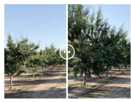
ALMOND UNTREATED VS. TREATED

Destructive pests such as nematodes, fungi, insects, weeds, and other pathogens can be devastating to a crop. Many common soil-borne issues can be managed with soil fumigation.